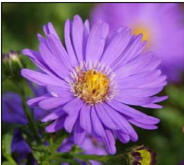
New England Aster