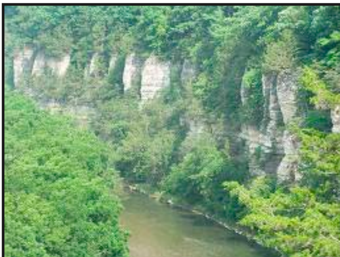
Bluffton Bluffs along the Upper Iowa River.